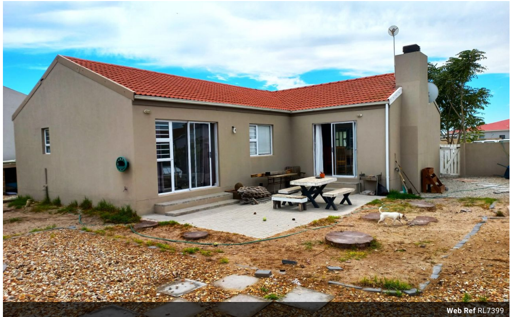
Web Ref RL7399