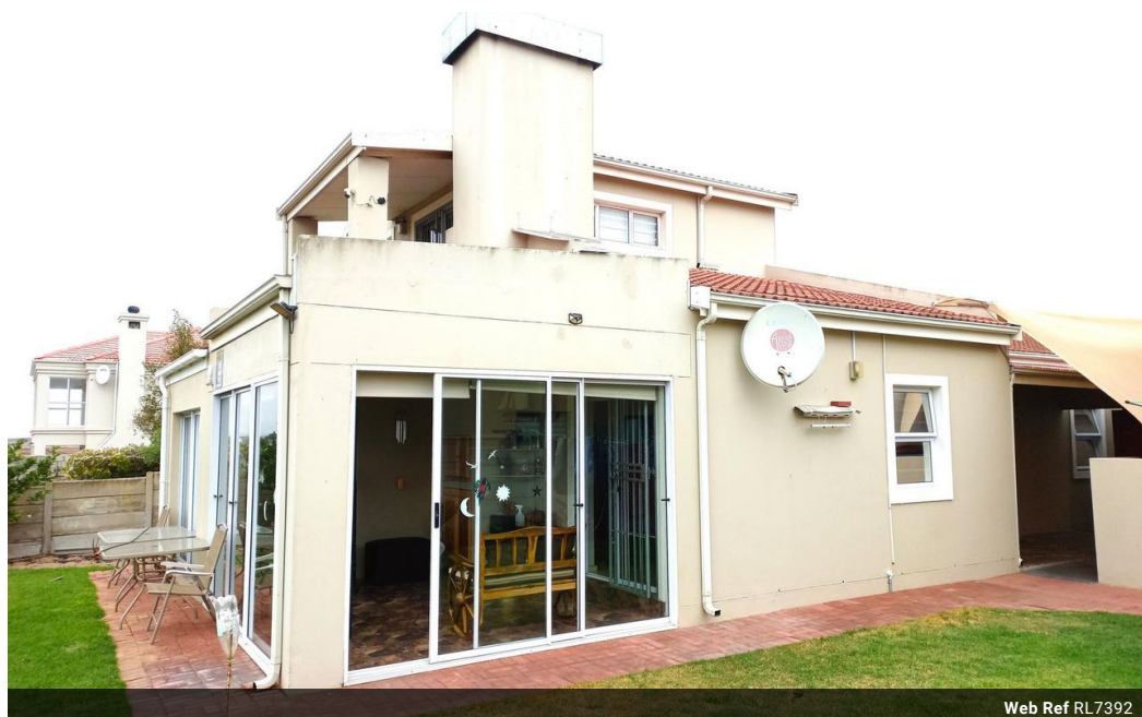
Web Ref RL7392

9 Nicolaas Cleeff Street De Zalze Wine Estate Stellenbosch 7600