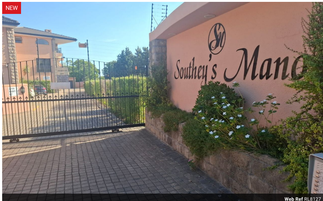
Web Ref RL8127

9 Nicolaas Cleeff Street De Zalze Wine Estate Stellenbosch 7600