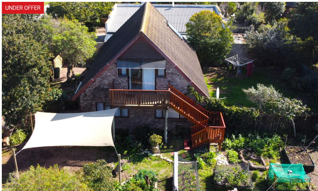
SOLE MANDATE Web Ref RL7725

9 Nicolaas Cleeff Street De Zalze Wine Estate Stellenbosch 7600