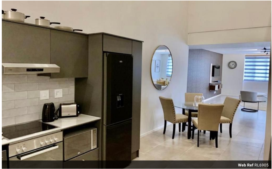
Web Ref RL6905

9 Nicolaas Cleeff Street De Zalze Wine Estate Stellenbosch 7600