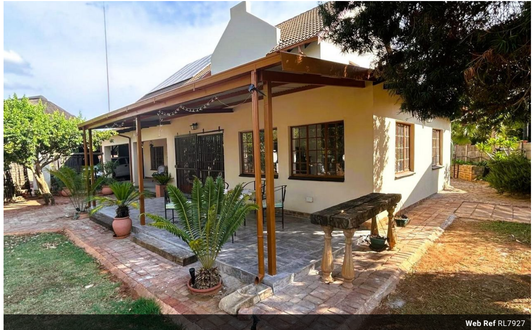
Web Ref RL7927