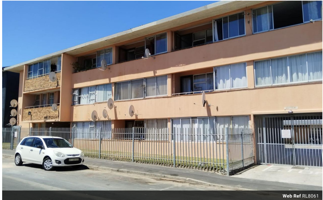
Web Ref RL8061

1 Bedroom Apartment For Sale in Avondale