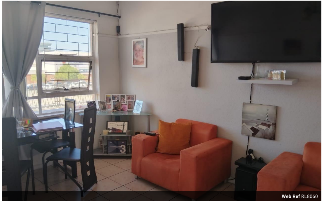
Web Ref RL8060

2 Bedroom Apartment For Sale in Avondale