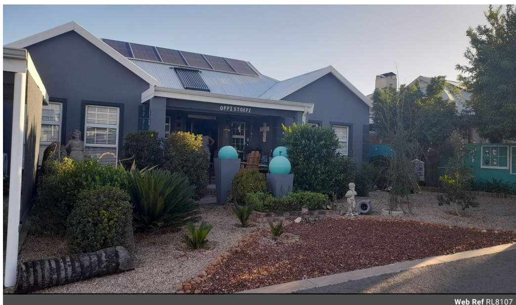
Web Ref RL8107

9 Nicolaas Cleeff Street De Zalze Wine Estate Stellenbosch 7600