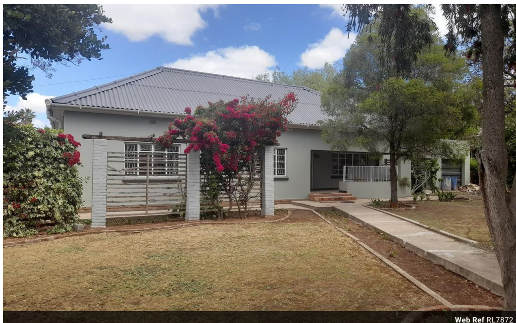
Web Ref RL7872

9 Nicolaas Cleeff Street De Zalze Wine Estate Stellenbosch 7600