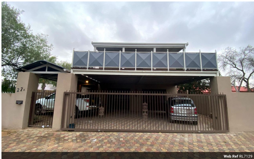
Web Ref RL7129

9 Nicolaas Cleeff Street De Zalze Wine Estate Stellenbosch 7600