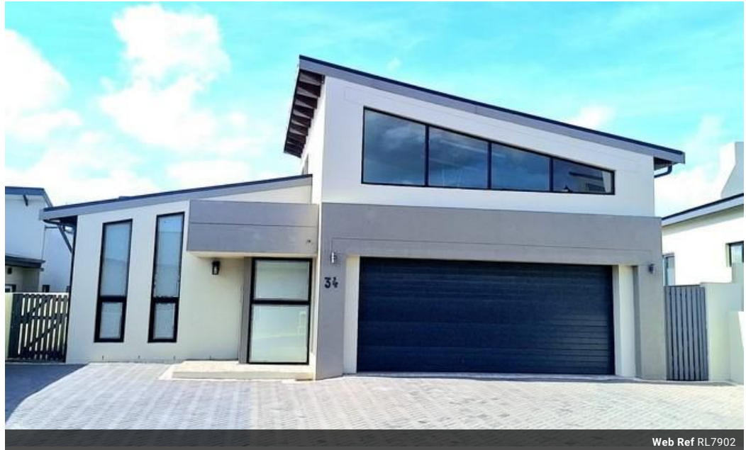
Web Ref RL7902

9 Nicolaas Cleeff Street De Zalze Wine Estate Stellenbosch 7600