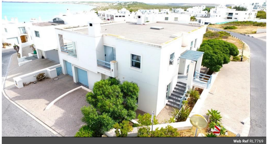
Web Ref RL7769

9 Nicolaas Cleeff Street De Zalze Wine Estate Stellenbosch 7600