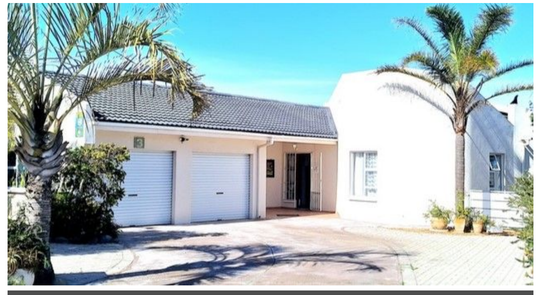
Web Ref RL8124