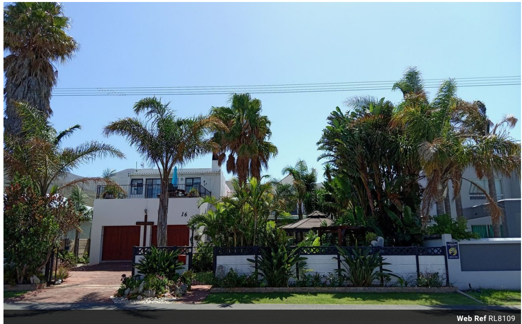
Web Ref RL8109

6 Bedroom House For Sale in Klein Berlyn