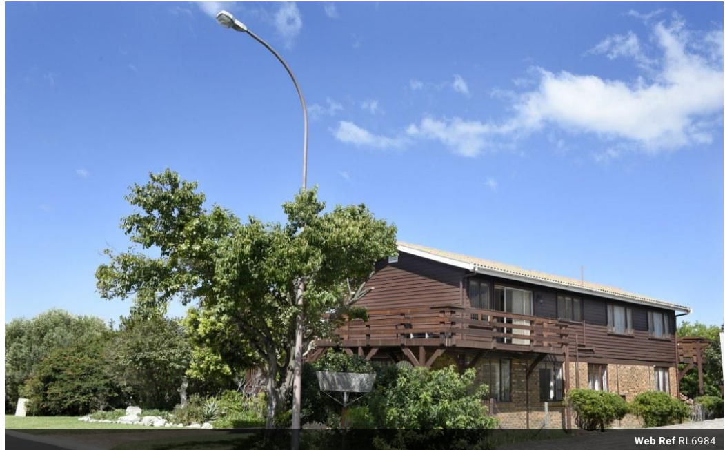
Web Ref RL6984

9 Nicolaas Cleeff Street De Zalze Wine Estate Stellenbosch 7600