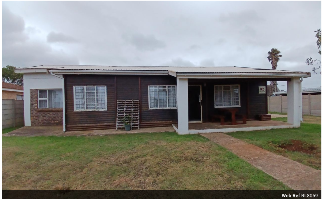
Web Ref RL8059

9 Nicolaas Cleeff Street De Zalze Wine Estate Stellenbosch 7600