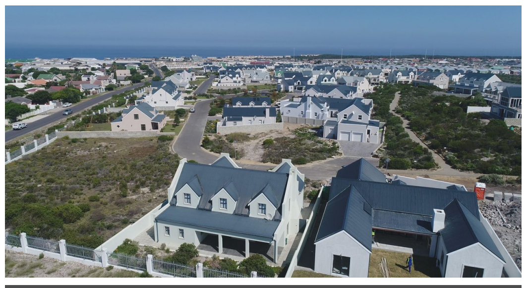
Web Ref RL7813

9 Nicolaas Cleeff Street De Zalze Wine Estate Stellenbosch 7600