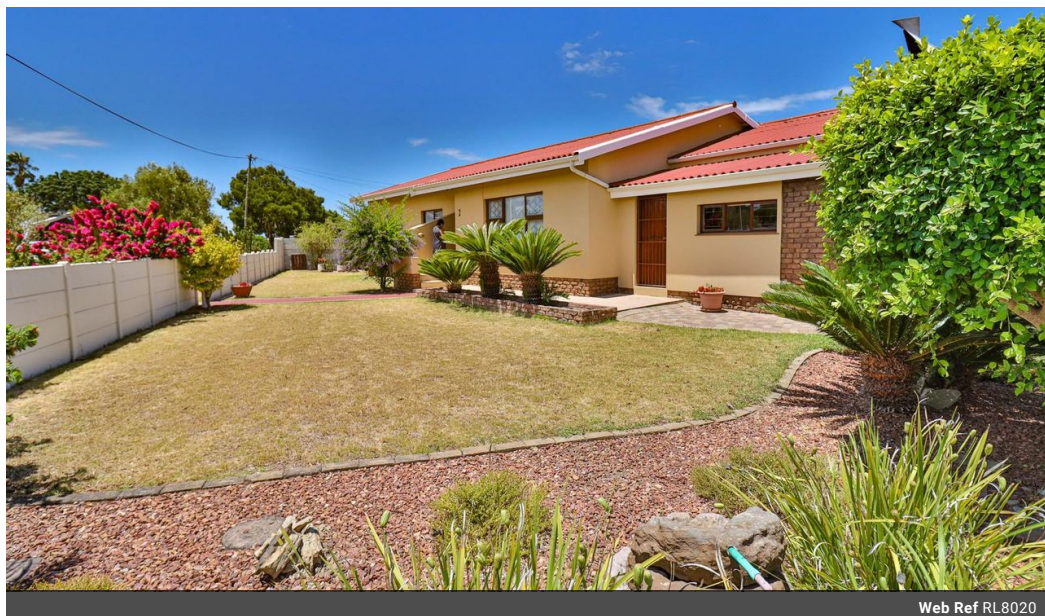
Web Ref RL8020

9 Nicolaas Cleeff Street De Zalze Wine Estate Stellenbosch 7600