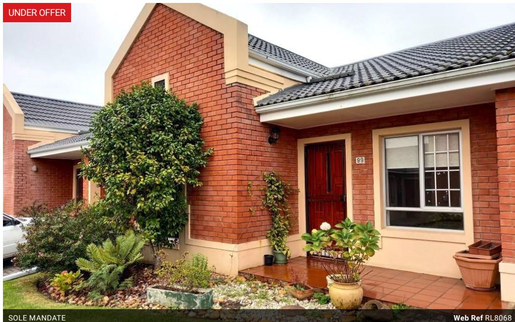
SOLE MANDATE Web Ref RL8068

9 Nicolaas Cleeff Street De Zalze Wine Estate Stellenbosch 7600