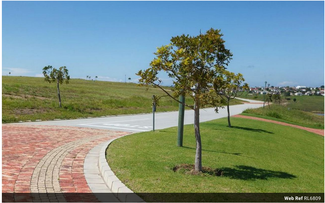
Web Ref RL6809