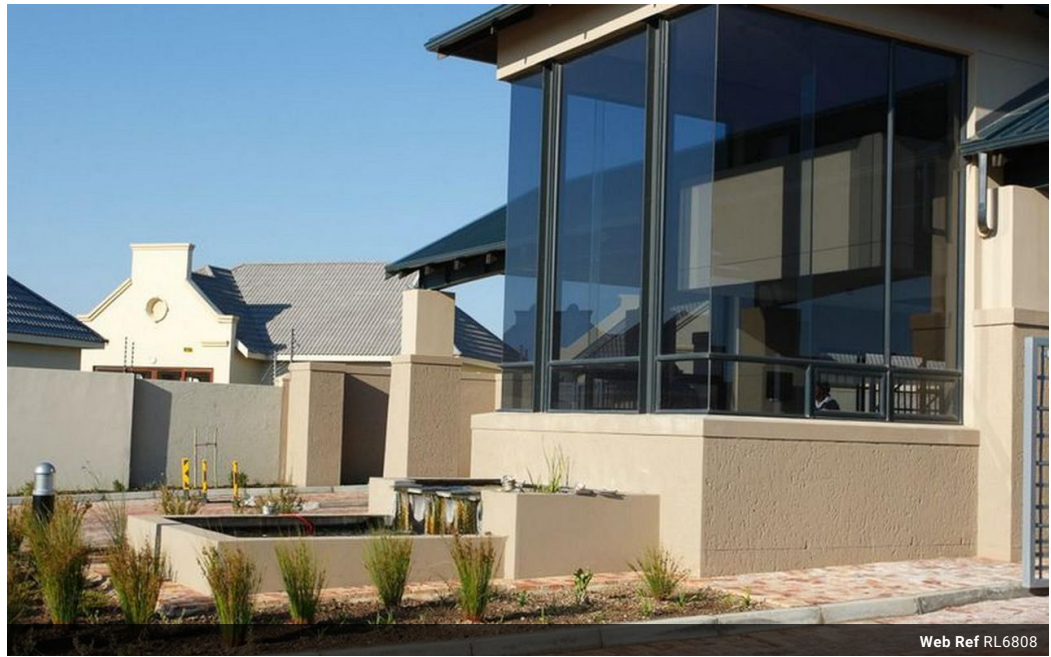
Web Ref RL6808