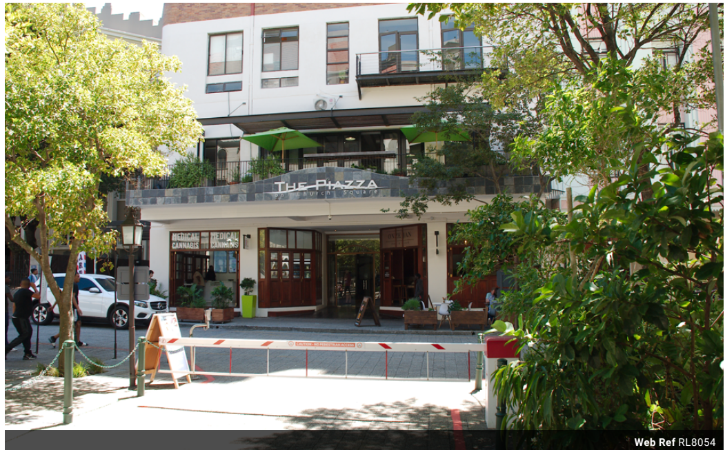
Web Ref RL8054