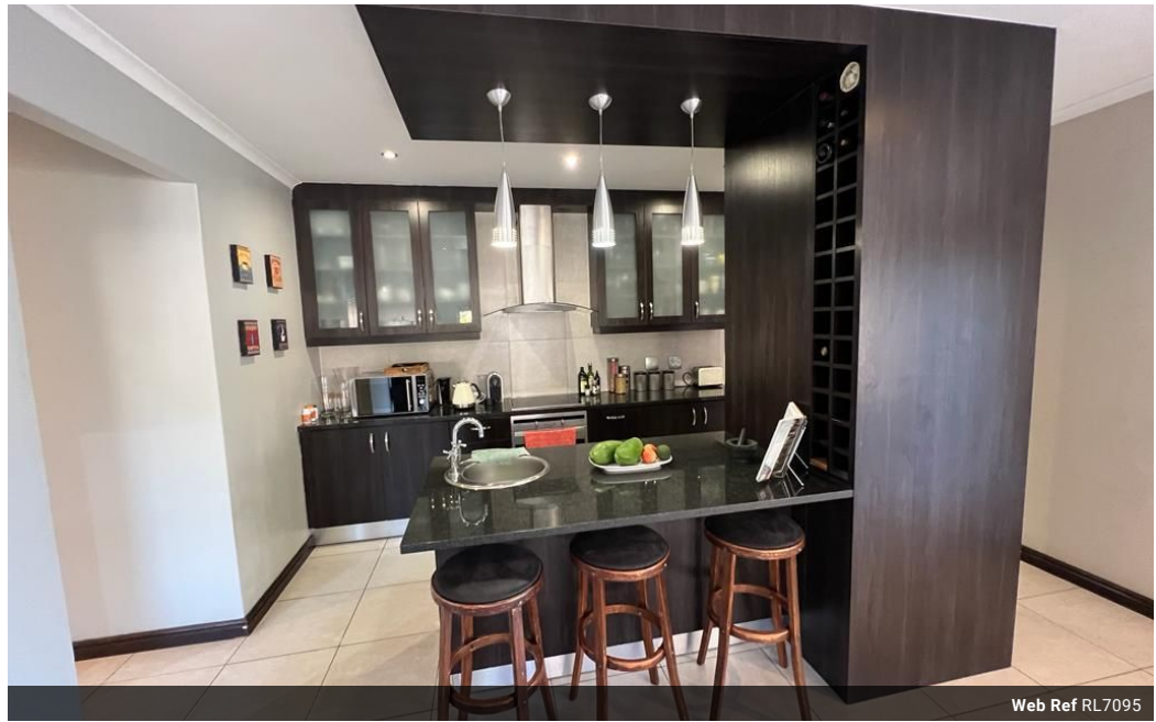
Web Ref RL7095