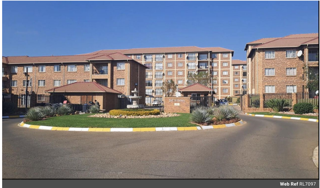
Web Ref RL7097

9 Nicolaas Cleeff Street De Zalze Wine Estate Stellenbosch 7600