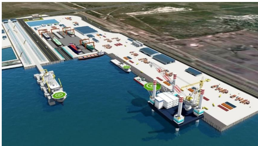
Web Ref CL161

9 Nicolaas Cleeff Street De Zalze Wine Estate Stellenbosch 7600