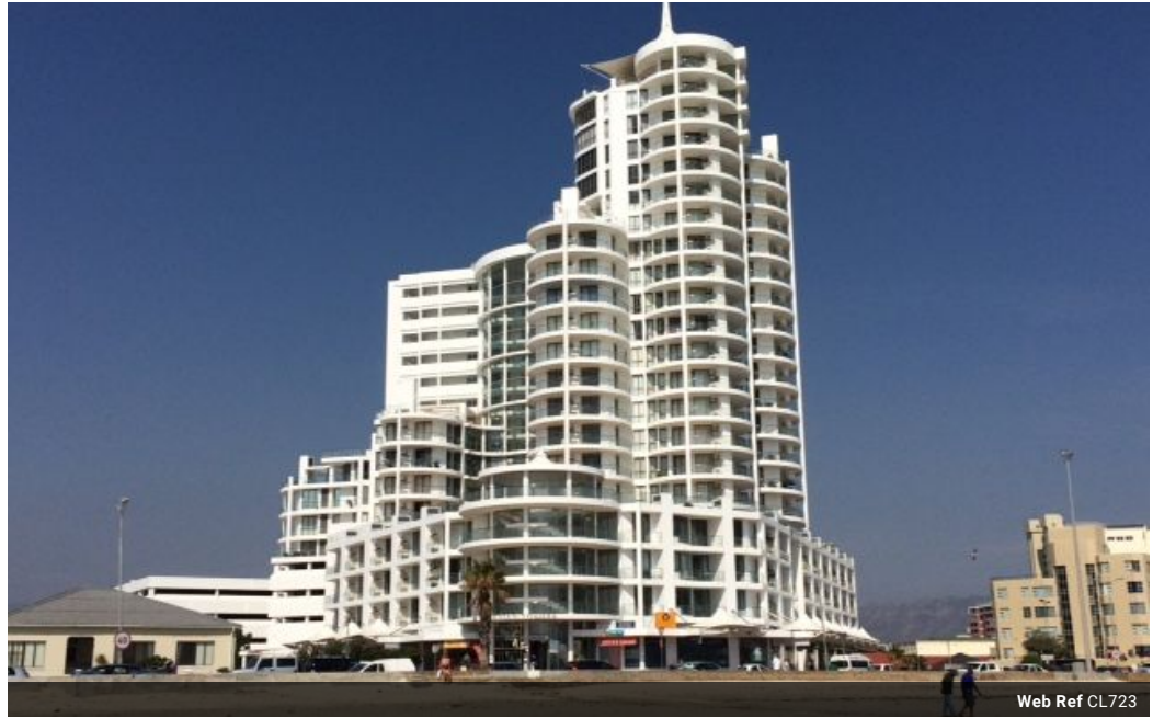
Web Ref CL723

9 Nicolaas Cleeff Street De Zalze Wine Estate Stellenbosch 7600