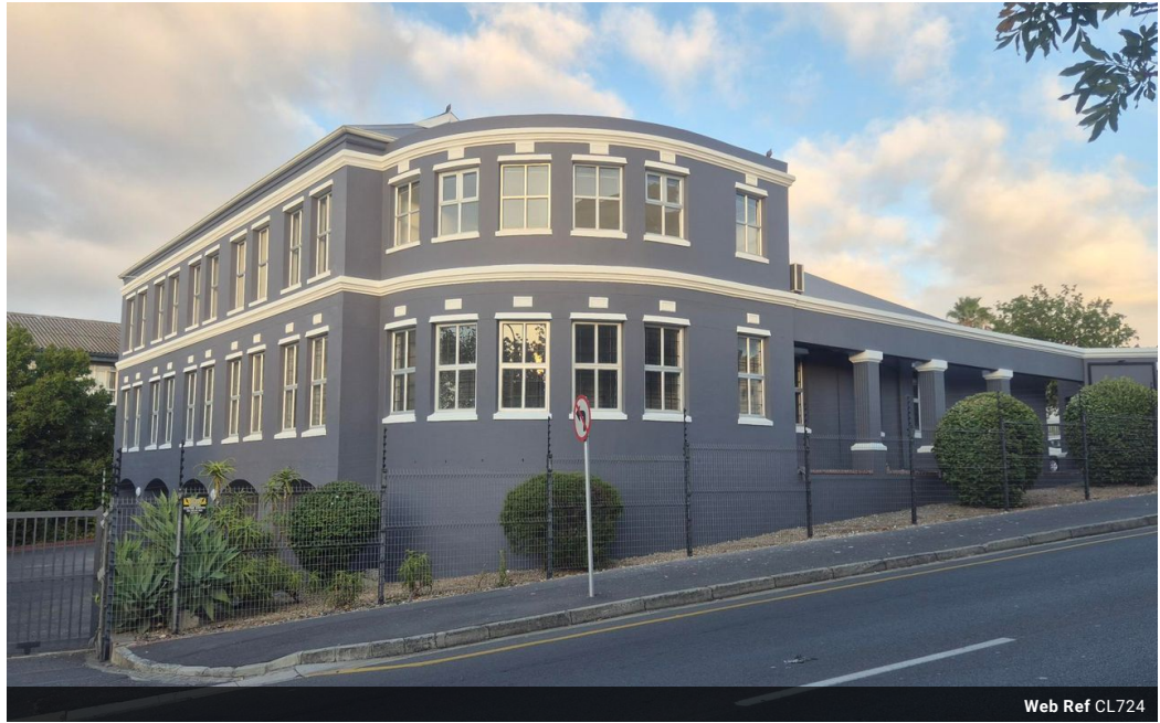
Web Ref CL724